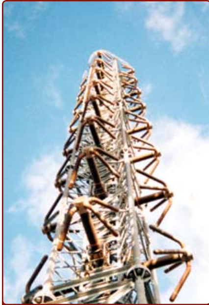
1180 Series FM Antenna