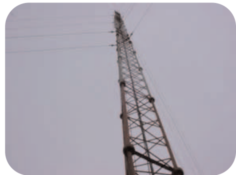
Existing Guyed Tower

Your Single Source for Broadcast Solutions