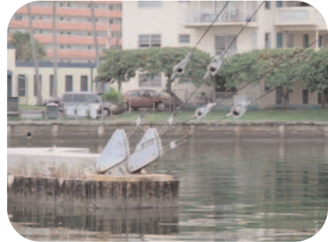
Existing Guyed Anchor in Bay